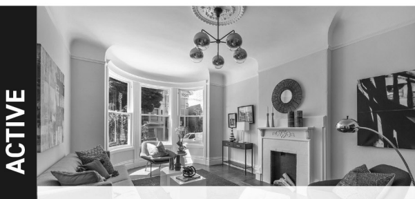
742 Haight St. | $1,649,000 742Haight.com