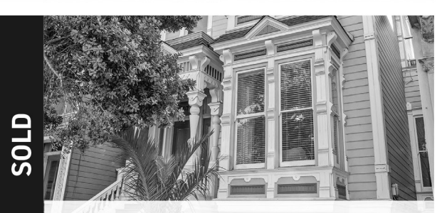
2079 Golden Gate | $1,720,000 2079GoldenGate.com