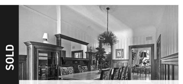
818 Steiner | $7,300,000 The Belle of Alamo Square Park